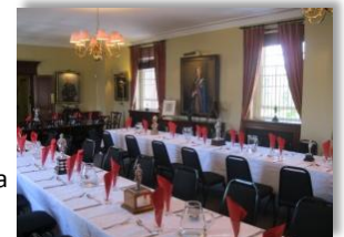
Dining Room Gurkha Museum