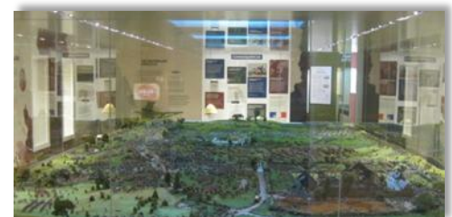
Waterloo Model RGJ Museum

Attendance is limited so early bids are recommended