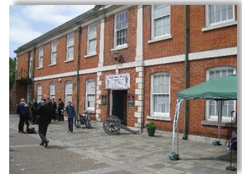
Royal Greenjackets Museum

The cost of attendance is £25, to include tea/coffee/ on arrival at the Royal Greenjackets' Museum and a Gurkha curry lunch in the McDonald Gallery in the Gurkha Museum. Drinks will be available during lunch in the McDonald Gallery at the Museum's usual prices.